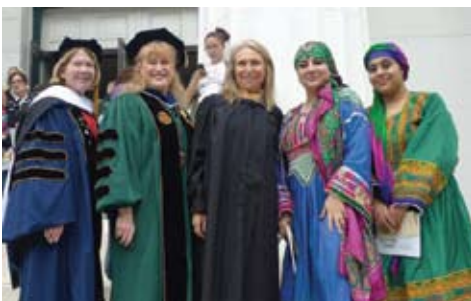
Russel Sage College

This month-long session provided a valuable bonding period for these students who went off to their schools well-prepared to face the challenges of freshman year at Brenau University, Meredith College, Montclair State University, Mt. Holyoke College, and Russell Sage College.