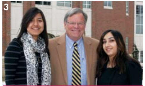
3 Juniata College