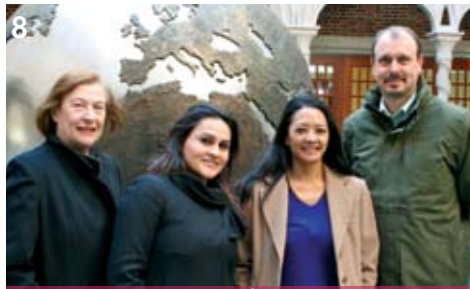
8 University of Richmond