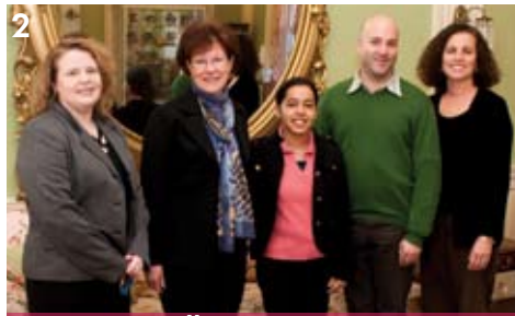
2 Hollins University