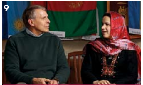
9 Bucknell University