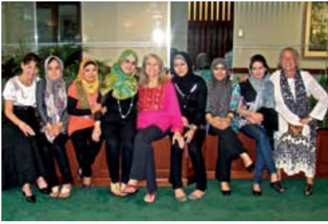
First day in Providence