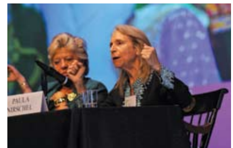
Bryn Mawr College