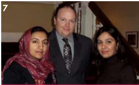
7 Brenau University