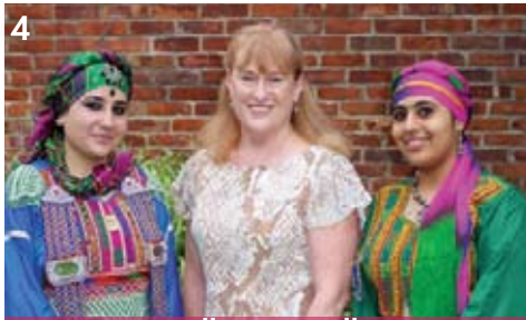
4 Russell Sage College