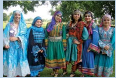
Matunuck, RI: Freshmen in Afghan regalia