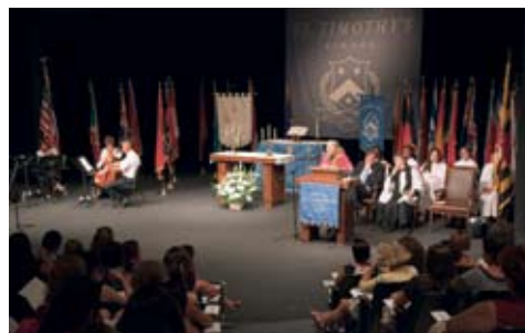
St. Timothy's School