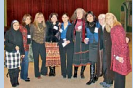
Wheeler School: IEAW students, staff and board members