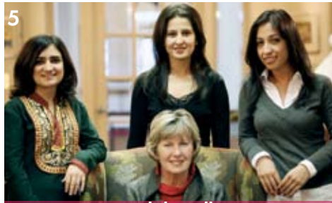
5 Meredith College