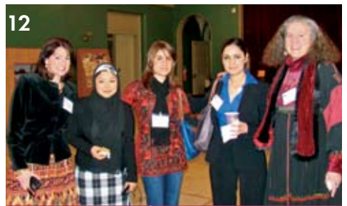
12 College of the Holy Cross