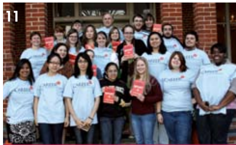
11 Randolph College