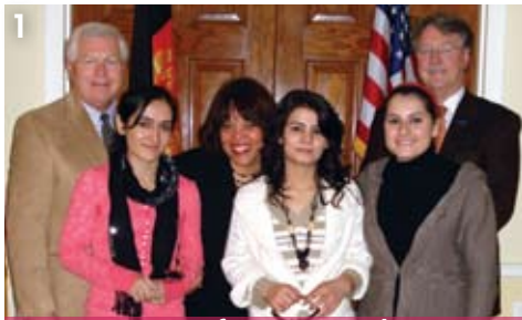
1 University of Mary Washington