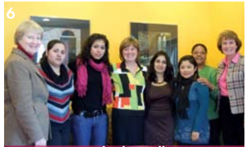
6 Mt. Holyoke College