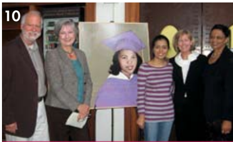
10 Sweet Briar College