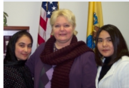
Diane Allen, New Jersey Senator, with Montclair students

They very much enjoyed and were impressed by the private tour and conversation with Senator Diane Allen,