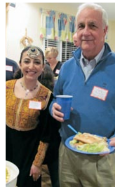
Mayor Emerald Isle with Adela