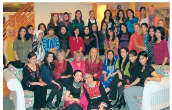
The IEAW family