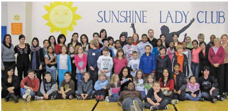
Sunshine Lady Boys and Girls Club

After months of planning and organization, Intersession came and went like a seagull taking flight, but the week certainly provided students with wonderful memories and new friendships that will last them a lifetime. An anonymous quote sums up the wishes of the volunteers and staff who had a chance to work with the students during their time on the island, “May you find safe harbor in every port ‘til the ocean winds guide you home.” Intersession is just a part of the journey and just one of the “ports” these women will experience as they work towards fulfilling their personal goals as well as renewing their energies, continuing on their paths to earning their degrees.