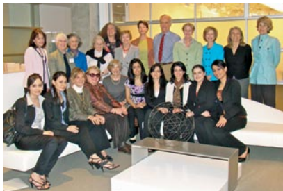
IEAW Board Meeting April 2010

Five of the graduates are accounting majors. That is great for Afghanistan since all the CPA's in the country are from Pakistan. These will be the first five CPA's that we know of in Afghanistan, and they are women!