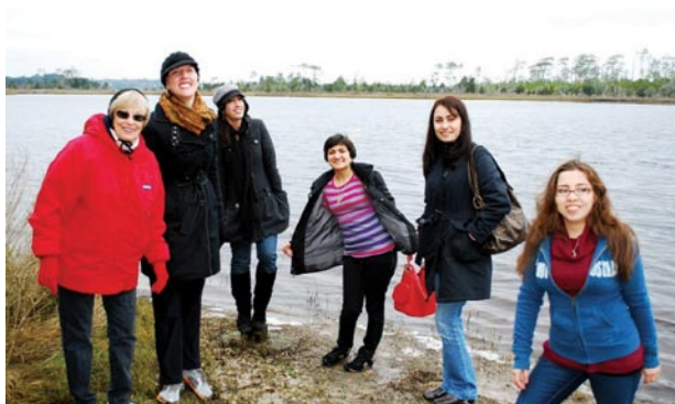
Volunteers and students