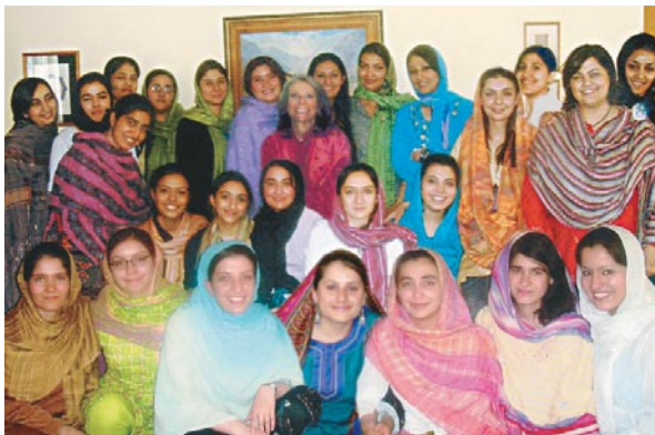
Students and founder in Afghanistan

The Doris Buffett scholars have arrived! They spent a month or more in summer ELS honing their writing skills before going off to their many wonderful campuses. The learning system in Afghanistan is memorization and very little paper writing. During this summer class they go to school 40 hours a week and write papers at night so they are well skilled in writing when they leave.